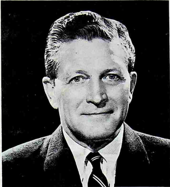
OTTO KERNER Governor

A warm welcome is extended to all auto race drivers and fans. We appreciate your support of our Illinois State Fair.